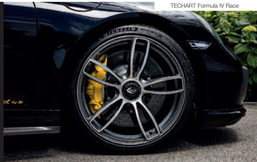
TECHART Formula IV Race