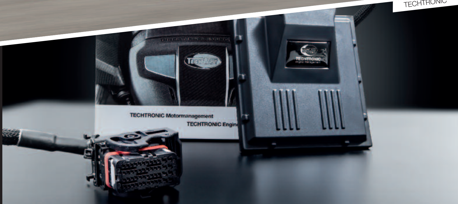
TECHTRONIC Motormangement TECHTRONIC Engine