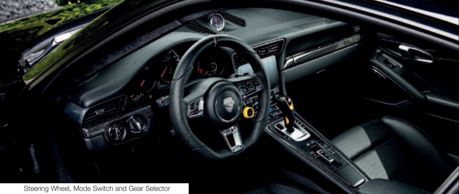
Steering Wheel, Mode Switch and Gear Selector