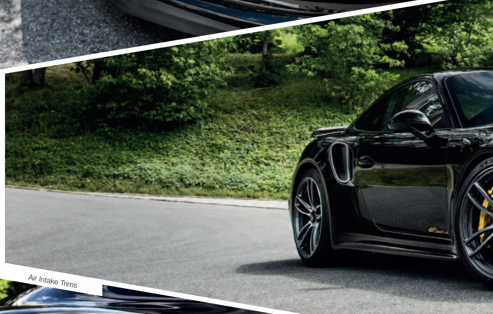
Air Intake Trims