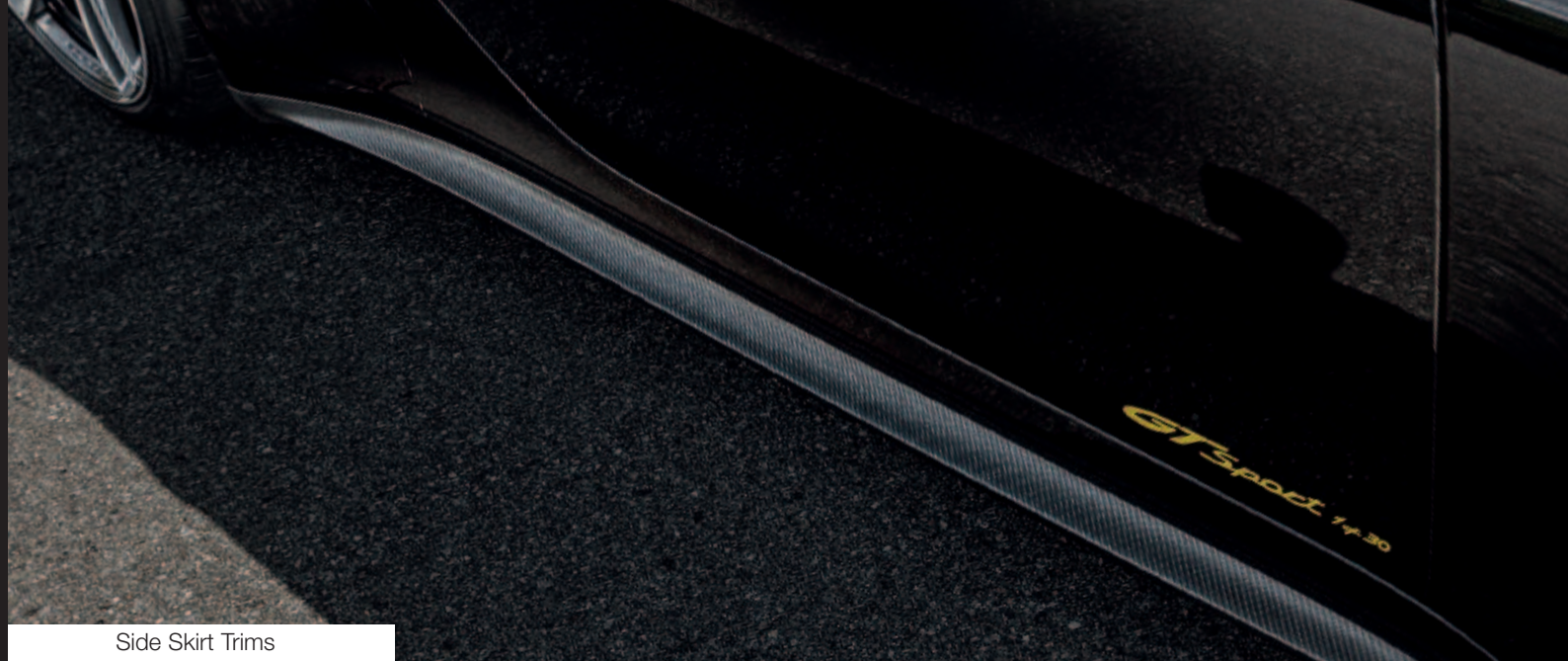
Side Skirt Trims