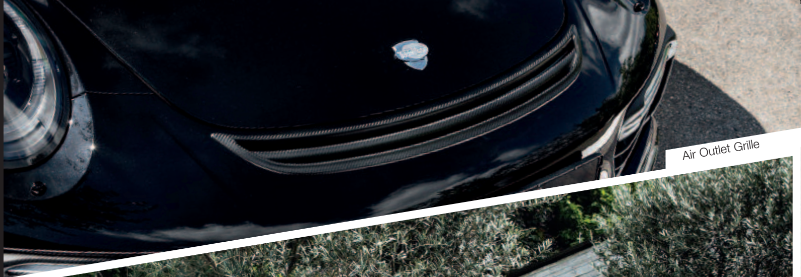
Air Outlet Grille